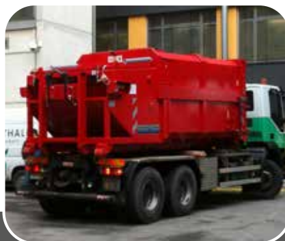
SKPCM-E with special height