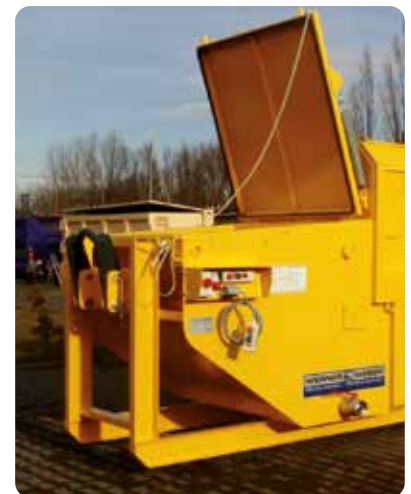
Cover over filling opening