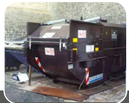
SKPCA-E at London Tower